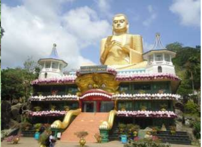
Dambulla Cave Temple